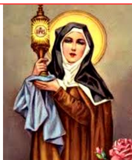
Aug 11 St Clare of Assisi